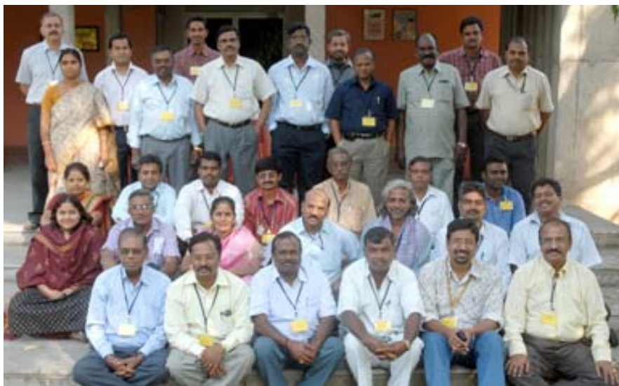
Participants of SRI meeting at ICRISAT