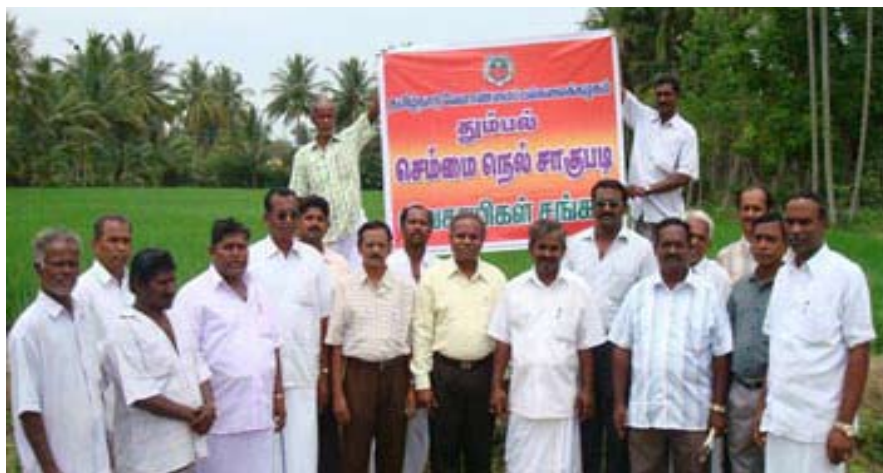
Thumbal SRI Farmers Association