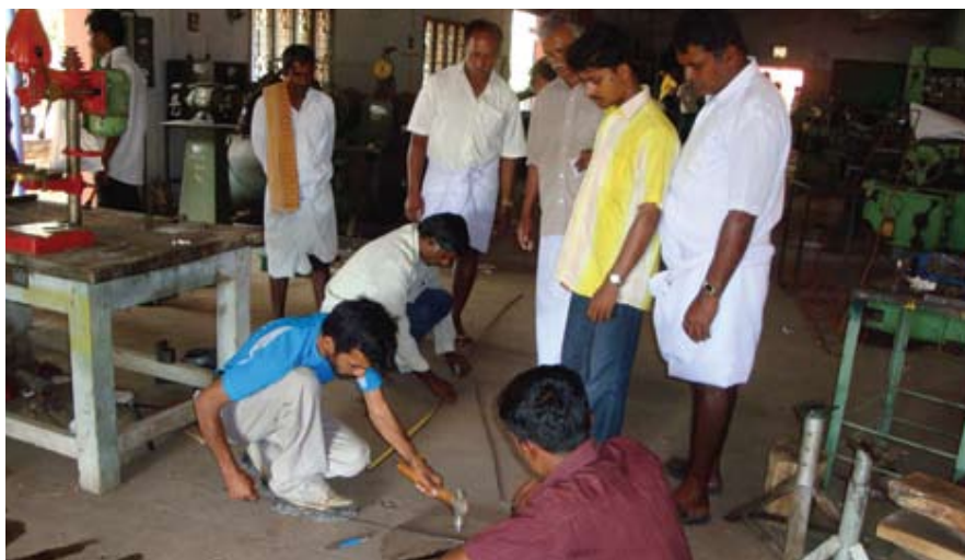
Training was organised for 1000 rural artisans on SRI implements