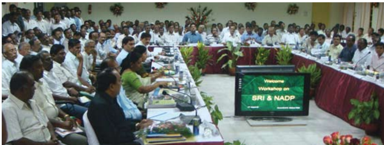
District Collectors from Tamil Nadu at the Workshop on SRI and National Agriculture Development Programme (NADP)

Continual visits by the Hon'ble Agricultural Minister, Members of Legislative Assembly, Secretaries to the Govt., Govt. officials, and the overwhelming positive responses from the farming community paved the way for