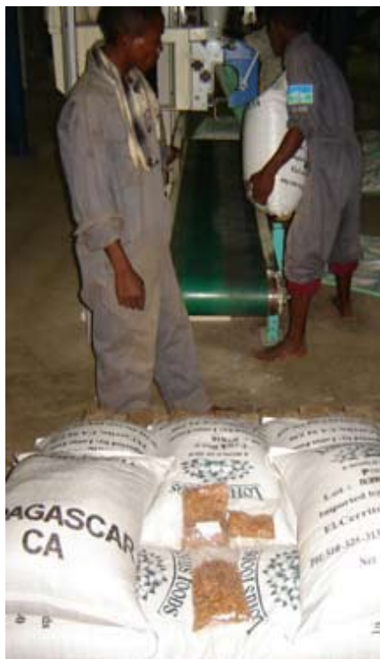
Pink rice that was grown by SRI farmers being milled and put into Lotus Foods bags destined for California.

Another goal was to launch three SRI-grown rice products under the Lotus Foods