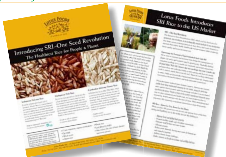
"Introducing SRI - One Seed Revolution - The Healthiest Rice for People and for the Planet"

undifferentiated supply pools that garner no premium price for farmers. Connecting SRI farmers to both domestic and export markets thus presents an important and novel opportunity to have significant economic and environmental impacts on smallholder rice communities.